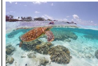
Great Barrier Reef