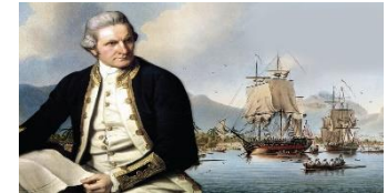
Captain James Cook